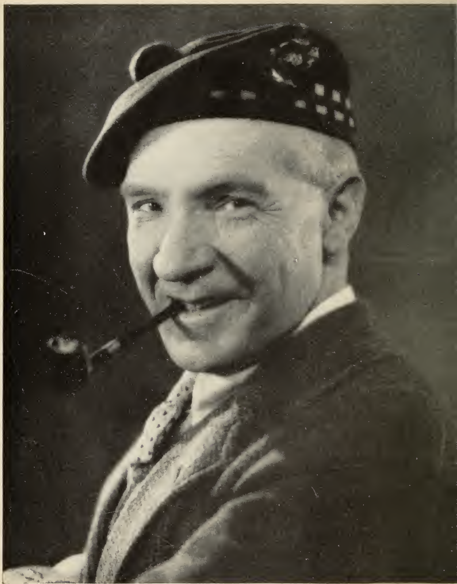
SIR HARRY LAUDER